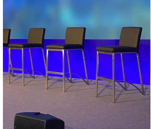
High backed stools